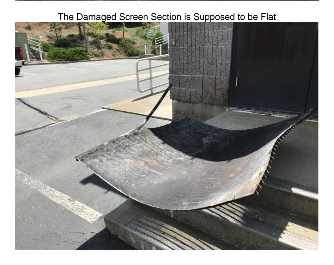
Page 2 of 3